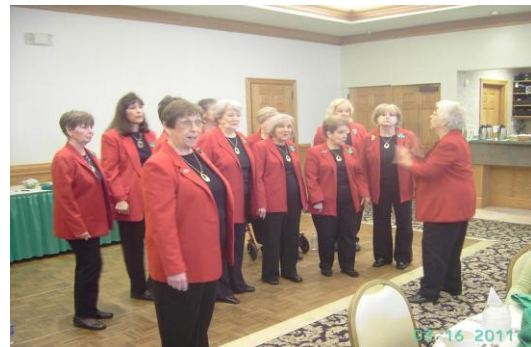
Bella a Cappella – A Women's Barbershop Chorus